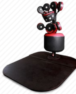
BoxMaster® Tower w/ Base