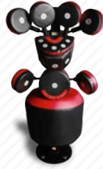
Optional Kick Pad